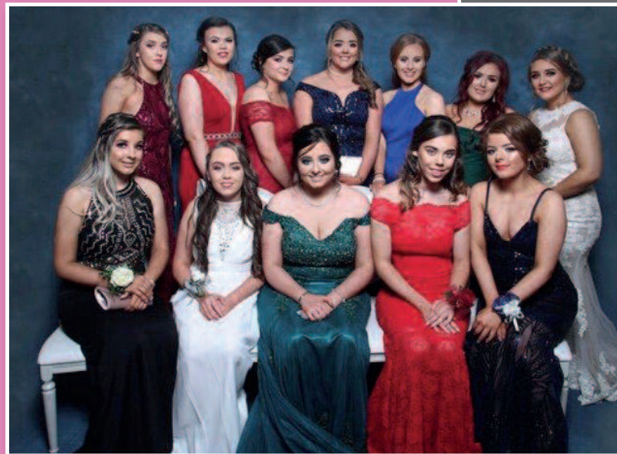
Year 14 Students enjoying the Formal