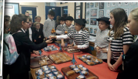
Students enjoying European Languages Day