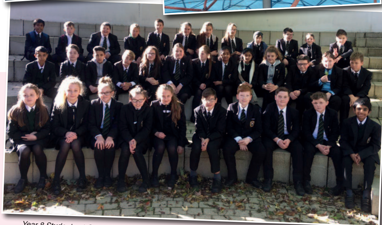
Year 8 Students at Carnfunnock